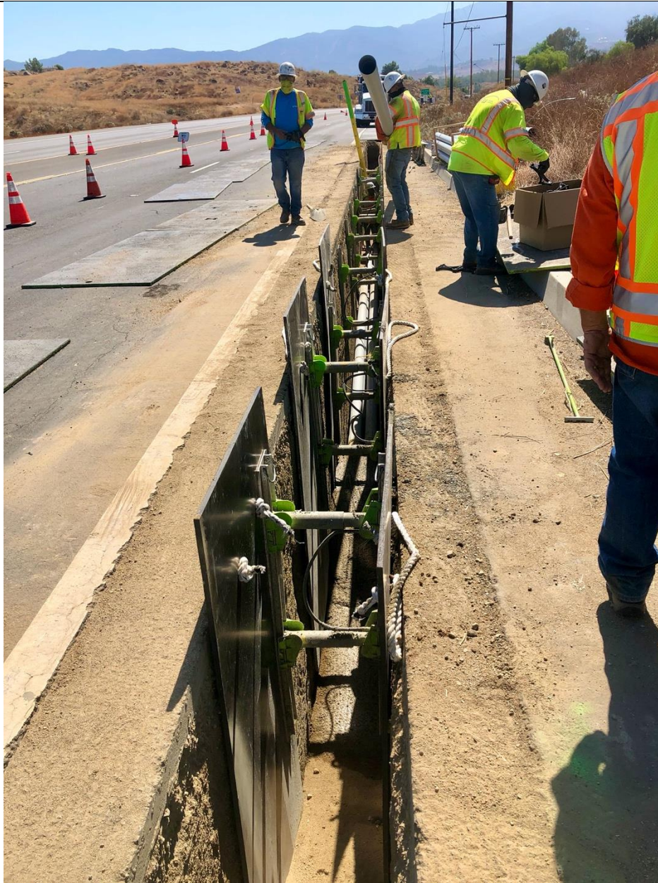
Photo 4 – Shored conduit trench within the road shoulder of Highway 74. Photo facing west