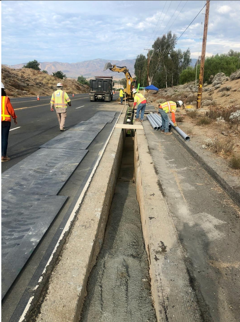
Photo 7 – Conduit installation crews working within Highway 74. Photo facing west