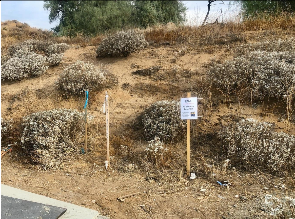
Photo 6 – ESA signage along the Segment 2 construction corridor. Photo facing north