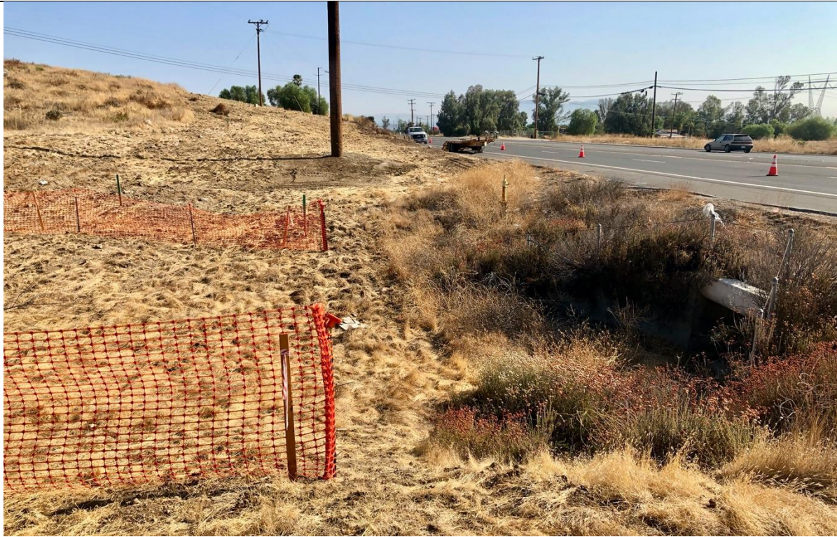
Photo 5 – A newly installed wooden pole and a small fenced off drainage. Photo facing east