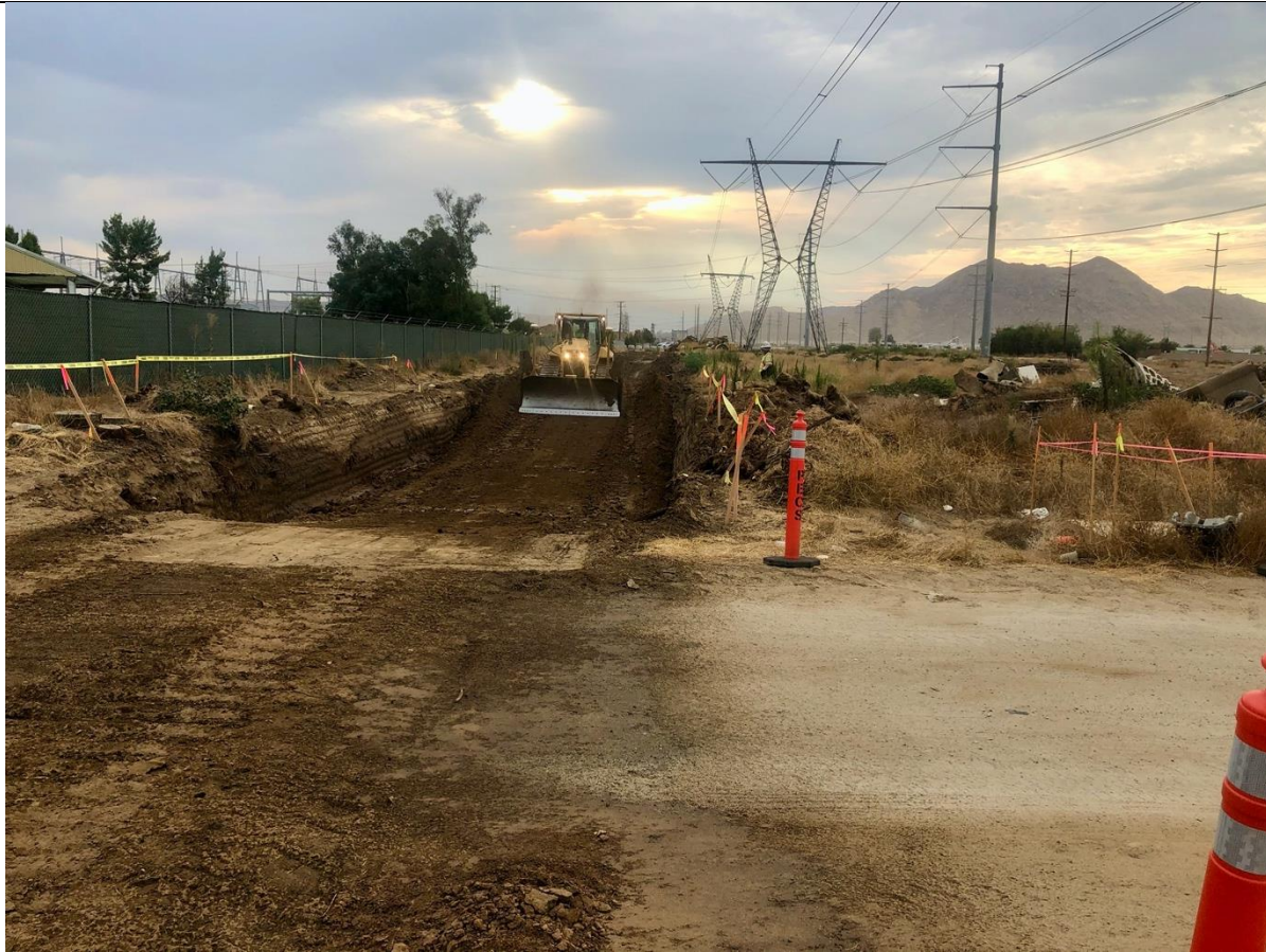
Photo 5 – A bulldozer digging out a gabion installation location. This work was monitored by the Paleo/Arch person. Photo facing east