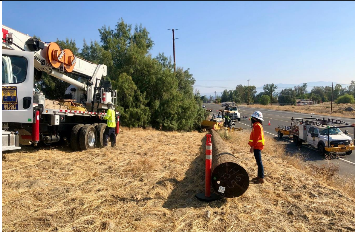
Photo 7 – Crews setting up to drill and install pole #171E. Photo facing east