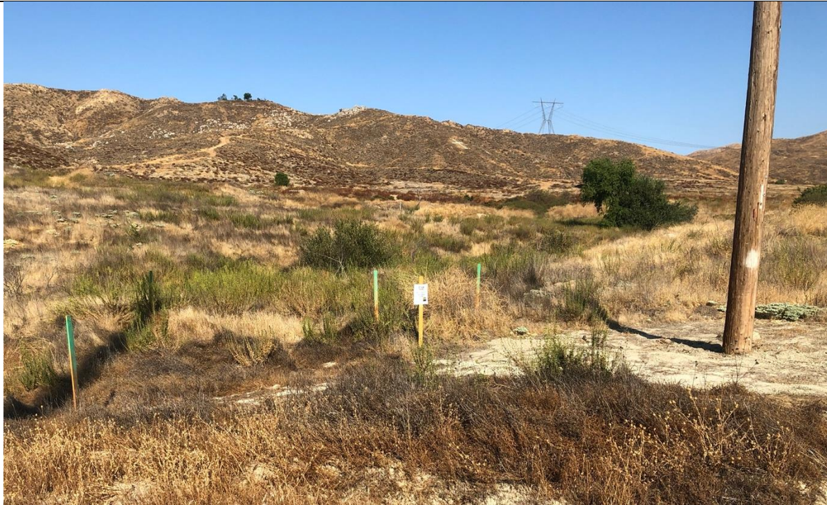
Photo 6 – ESA signage along the Segment 2 construction corridor. Photo facing north