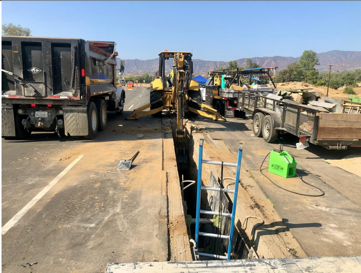
Photo 8 – Trenching for the conduit installation. Photo facing west