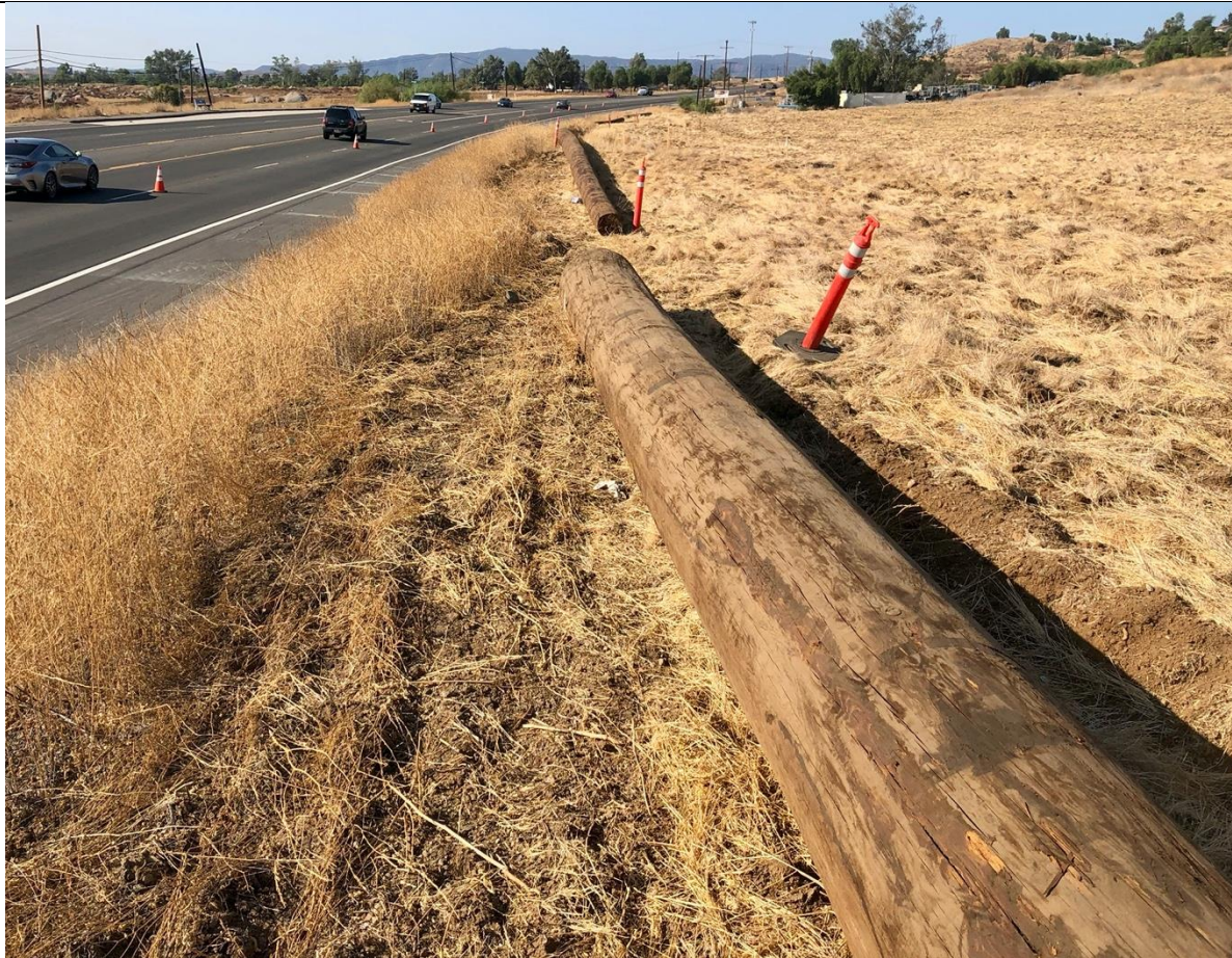
Photo 4 – Wooden poles placed along Highway 74 in Segment 2. Photo facing west